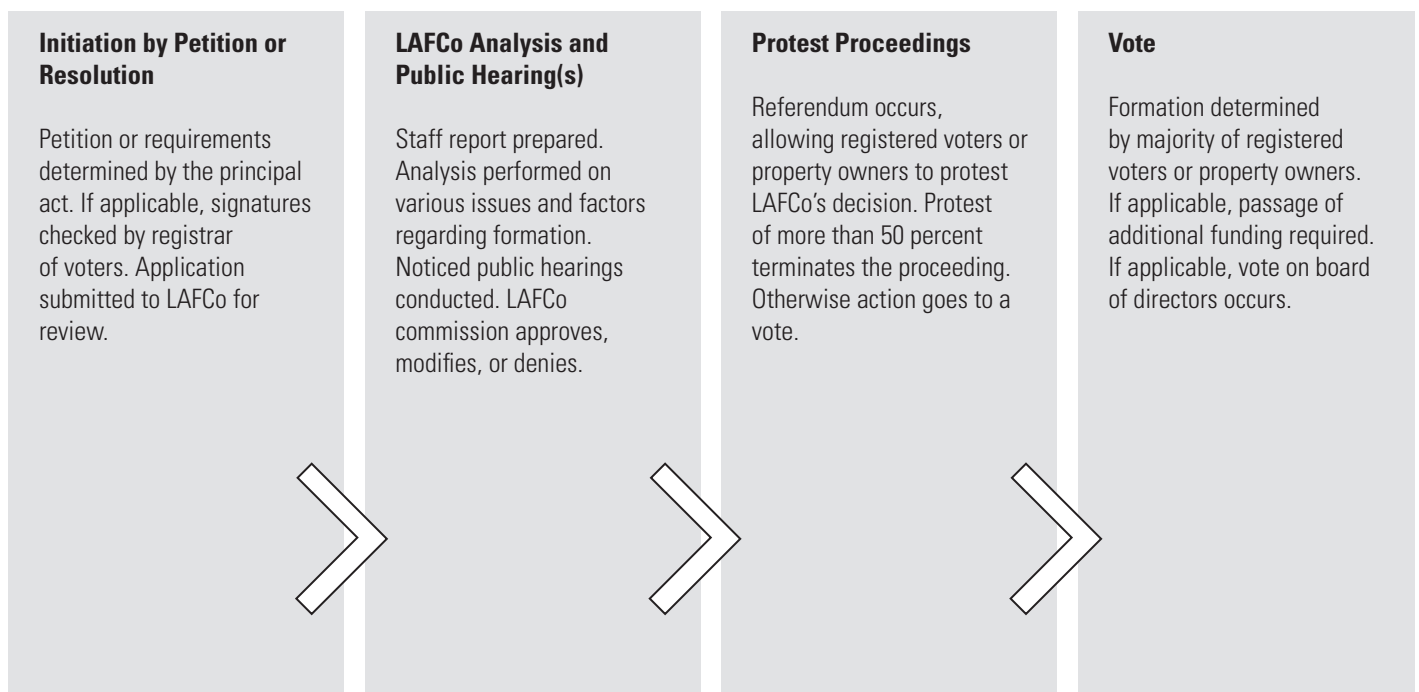
Exhibit IV-1 Flow Chart of the Formation Process

Should the formation effort proceed to an election, proponents and opponents should be aware of the legal requirements for campaign contributions. Under the Political Reform Act, individuals and organizations face campaign reporting obligations once they qualify as a “committee.” Check with your local ROV website or the FPCC website for more specific information on campaign disclosure.